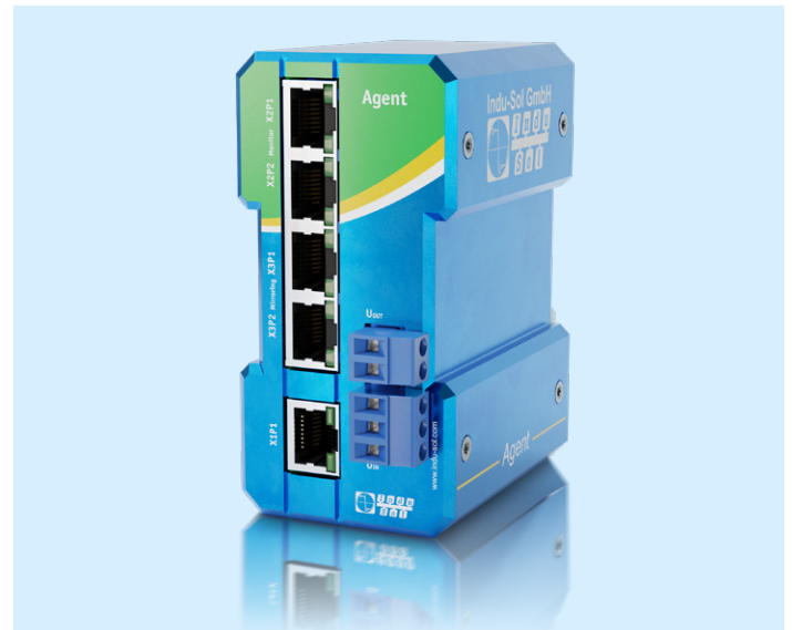
PROFINET Agent - "Agent Blond"

The UOUT (24 V DC) port can be used to supply power to additional analysis tools.